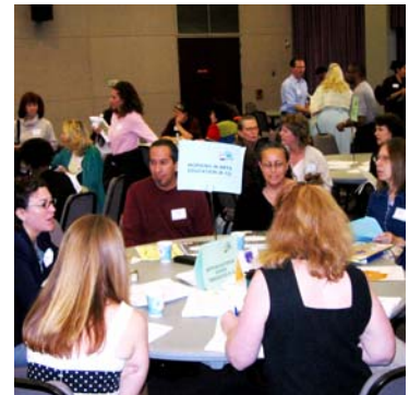
Lots of information and resources for both individual artists and small budget organizations!

REGISTER ONLINE through SurveyMonkey by visiting this website: