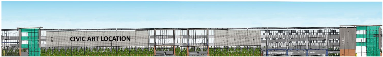
Image 2: Civic Art location on east side of structure, 21'-8" x 144'