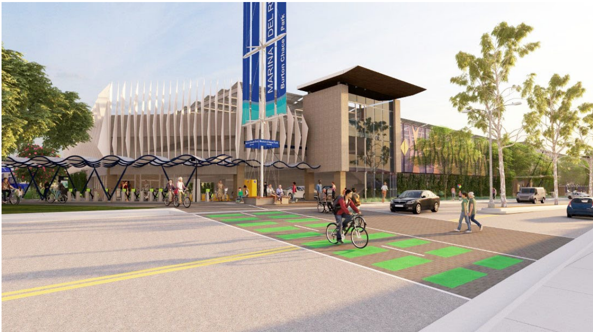
Image 1: West end of the parking structure facing the Marvin Braude Bike Trail