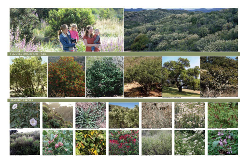
Puente Hills Landfill Park will include a diverse array of native plants

The Puente Hills Landfill Park Master Plan can be found here: 2016 Master Plan — Puente Hills Landfill Park