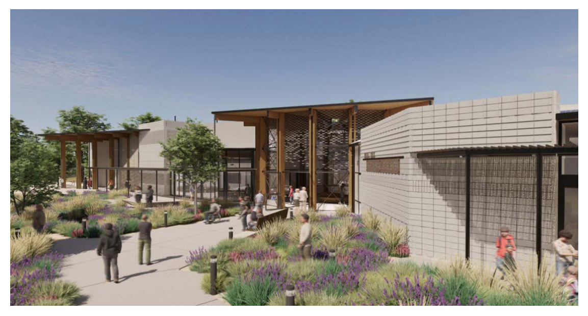
Rendering of Environmental Justice Center