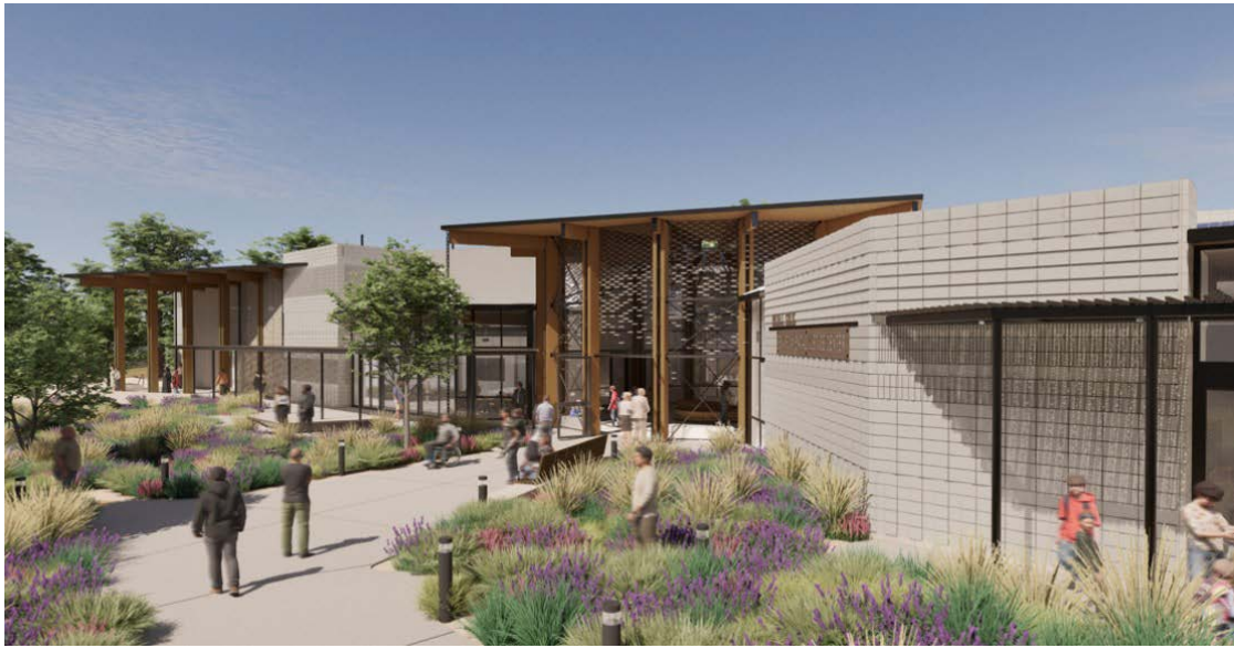
Rendering of Environmental Justice Center