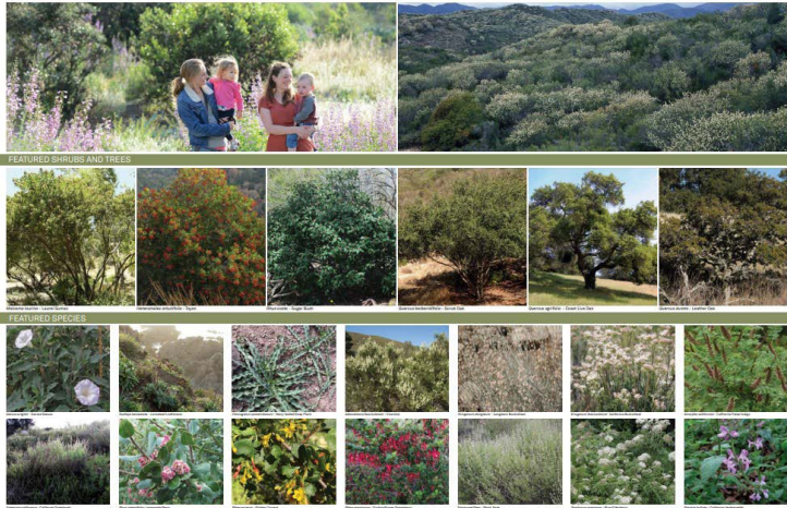
Puente Hills Landfill Park will include a diverse array of native plants

Section 2.14 of the Puente Hills Landfill Park Master Plan includes interpretive and civic art themes. Please refer to pages 68-70 for additional information.