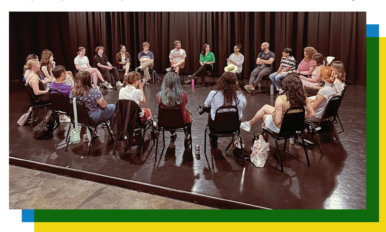
Theatre vs. The Industry