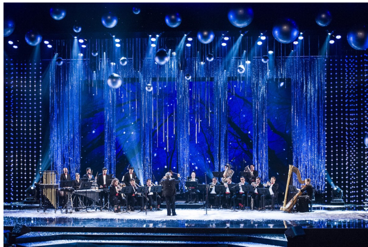
The Southern California Brass Consortium performing the finale of the 57th Annual L.A. County Holiday Celebration.

Should you have any questions or want more in-depth information on any activity, please call the staff at (213) 202-5858