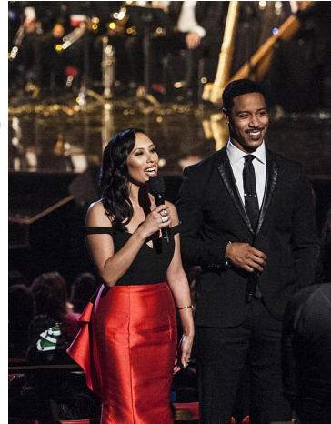
Hosts Cheryl Burke and Brian White