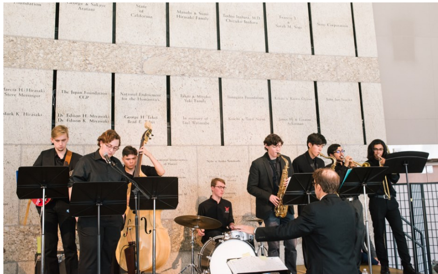
Students from Marshall Fundamental Secondary School Jazz Band