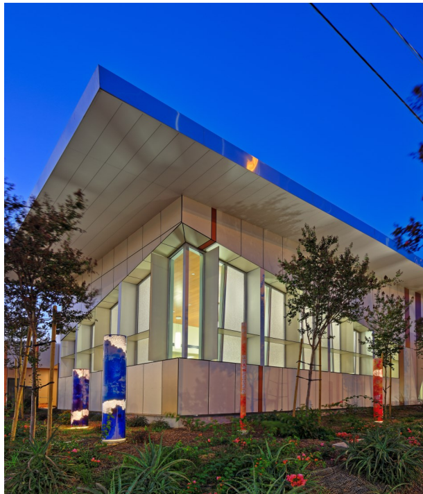
South Whittier Library's newly installed civic artwork by artist Louise Griffin: The Coming Together of a Community

The Coming Together of a Community by Louise Griffin is a series of 17 sculptures placed along the library's landscaping and walkways. The artwork reflects the written words given to the artist by residents when describing their community: "together," "family," "unity" and "home" inspired Griffin to design the sculptures in varying heights, from 3 feet to 7 1/2 feet, and diameters, from 4 inches to 13 inches, to depict the multicultural and generational make up of the community. Fabricated in powder-coated aluminum, the vibrant sculptures display collaged images of South Whittier's history such as the Tongva Tribe, Pio Pico, the railroad industry and the Pacific Electric light rail. Alongside images are taken from the natural landscape and wildlife that make up the local ecology. The sculptures are organized thematically, and include the names of all five South Whittier Neighborhoods in bold white text. Internally lit at night and perforated in unique patterns, the artworks transform into large lanterns across the site, as their placement direct visitors towards the entrance of the new library.