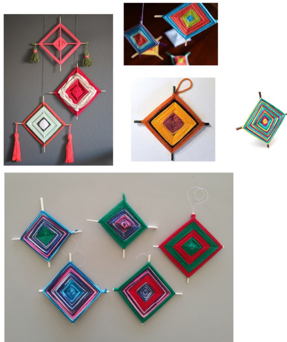
sample of Ojo de Dios crafts